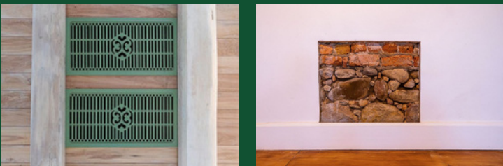
House Seerus Hermanus House Van Eeden Stellebosch