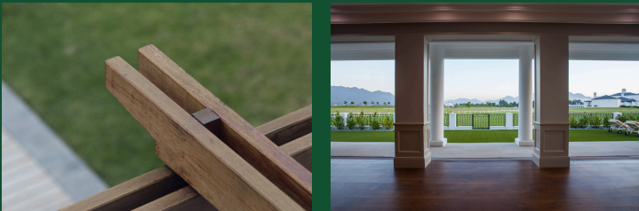
River Club 5 Val de Vie Estate 35 Longlands Stellenbosch