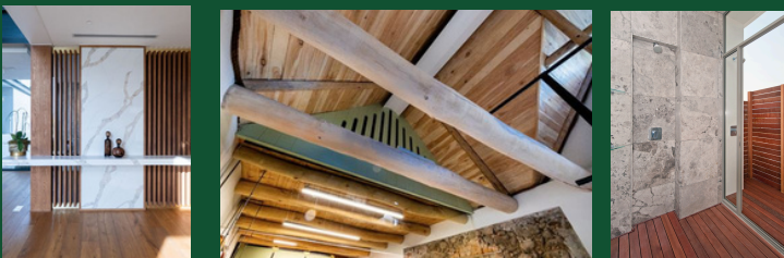
House Thorntree Val de Vie Estate Backsberg Fishing Retreat Franschhoek