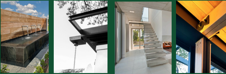
NG-Kerk Suider Paarl Paarl Oude Leeskamer Stellenbosch