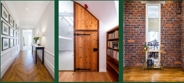
House Bethlehem Kylemore Canetsfontein Manor & Guest House Wellington