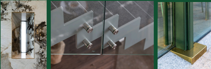
Rosenhof Stellenbosch Val du Luc Lake House Franschhoek